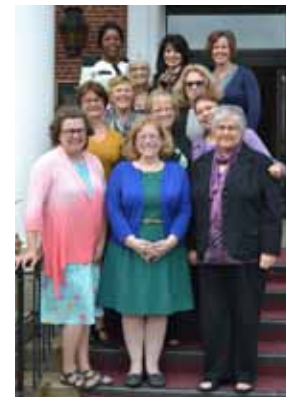
Some members of the National Coalition of Advisory Councils on the Status of Women in Charlottetown in September.