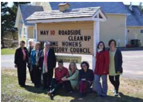
Council members and staff in Canoe Cove.

national Women's Day activities organized with the support of the PEI 2014 Fund. Council members and staff shared their experiences of Family Violence Prevention Week activities.